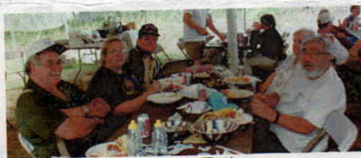
They just keep on Eating