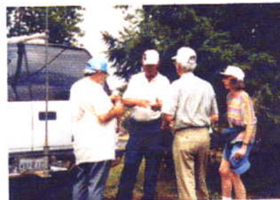
K8MZA CC Legal Counsel hands Citation to WK5S (N5SV)