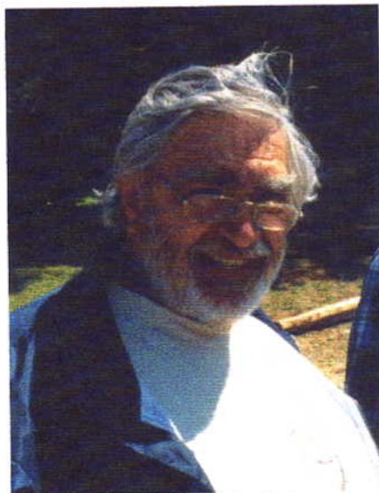
K8MZA 21k # 1