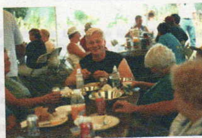
The Man in Black VE6TG