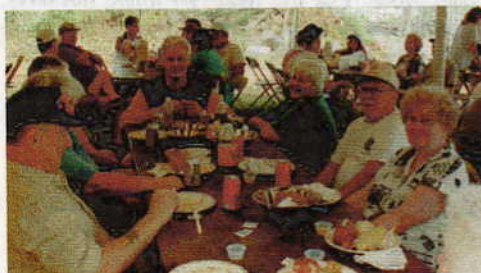
Food Clams Corn