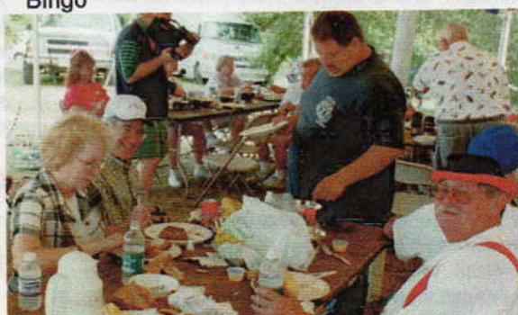
and more Food