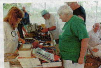
Look at all this stuff