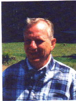
AB6TX Masters # 1