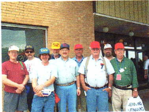
The Gang at Dayton WA2JIM W9JFM WK5S K0WJ KA9JAC KX8W N0YPA KO6CS K4SGF