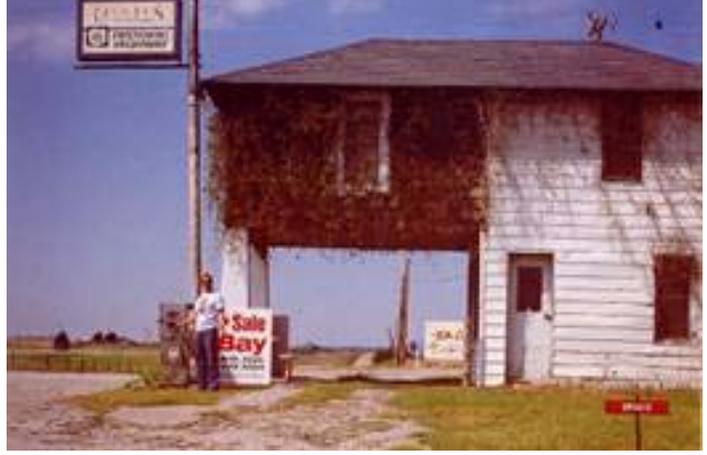
Lucille's gas station in Miami, Ok.

Come experience the fun and history of Route 66 in Oklahoma. This is truly a case where "The Journey is the Destination."