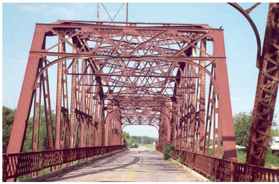
Unique bridge along Route 66. tique stores where you are

Interested in old bridges? We've got Pratt bedstead, camelback Warren pony truss, modified Pratt through-truss, a