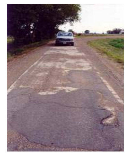
Nine-foot road near Miami, Ok.

exploring museums? We have two fantastic Route 66 Museums and a host of wonderful county museums filled with enough interesting stuff to make your head spin. Stop in Elk City to see the National Route 66 Museum and in nearby Clinton is the Oklahoma State Route 66 museum. And, of course, every town along Route 66 has plenty of an-