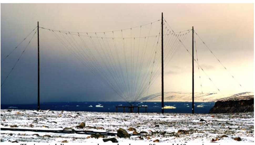
The inverted discones can be used as low as 80m and 160m, using a tuner.

"I congratulate Rick for winning the election," See 'Mobley,' page six