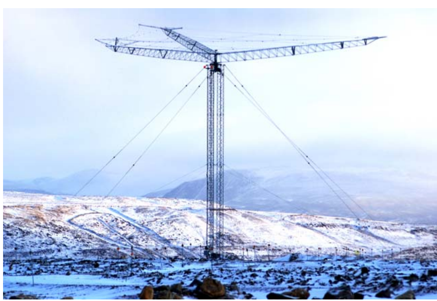
The log periodic was finally fixed. The feedline was crushed by snow removal equipment. Even so, the rotor is not working and it only faces in one direction.

always some complications. This trip is not exempt to say the least. Here that has caused me and may others some anguish.