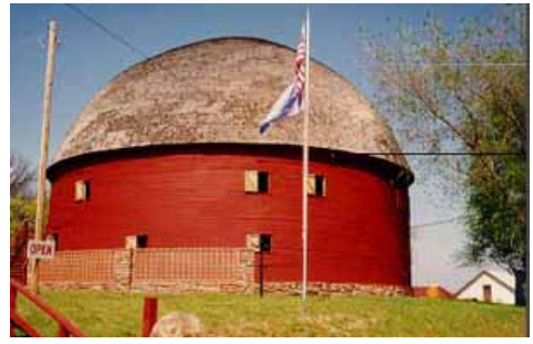
The round barn in Arcadia, Ok.