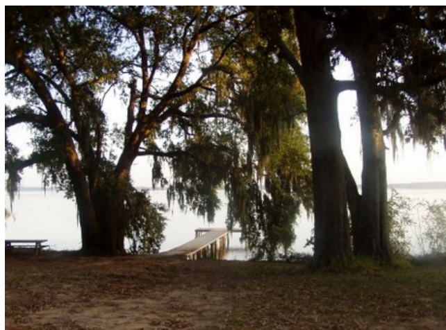
View from cabin near FL/GA line

From FL/GA we traveled to TN for supper with Dave KI4DFS and operated from the TN/SC line with him. We stopped for a short visit with Ed NN2E in Kentucky and operated from a church yard near there. At the IL/IN line we found a nice quiet spot a ways south of the interstate.