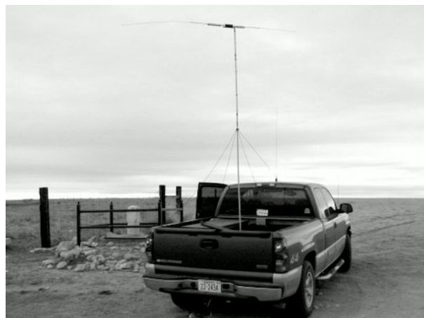
Cornhusker special with 40m and 160m resonators at WY/CO/NE