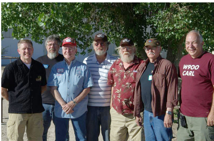
Masters : AC7RA, KD4POJ, AA0ZP, W2UJ, WT0A, KC0MS and W900