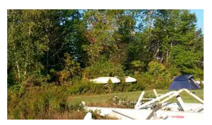
That's my blue hotel in picture