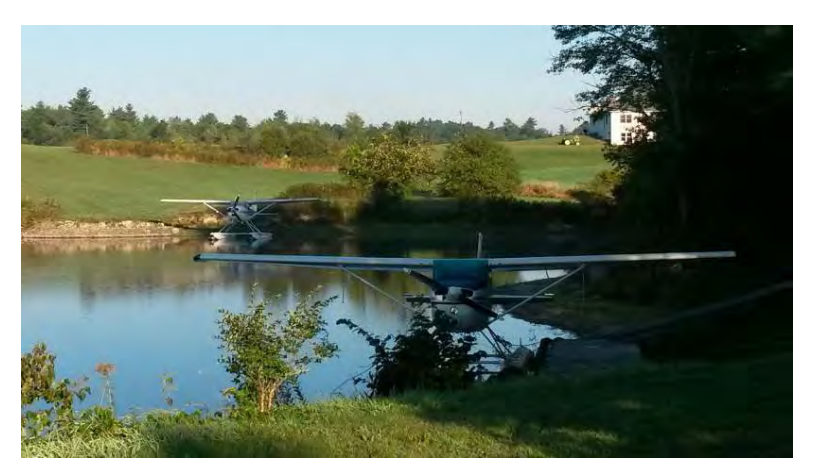
seaplane cove and me on the right.