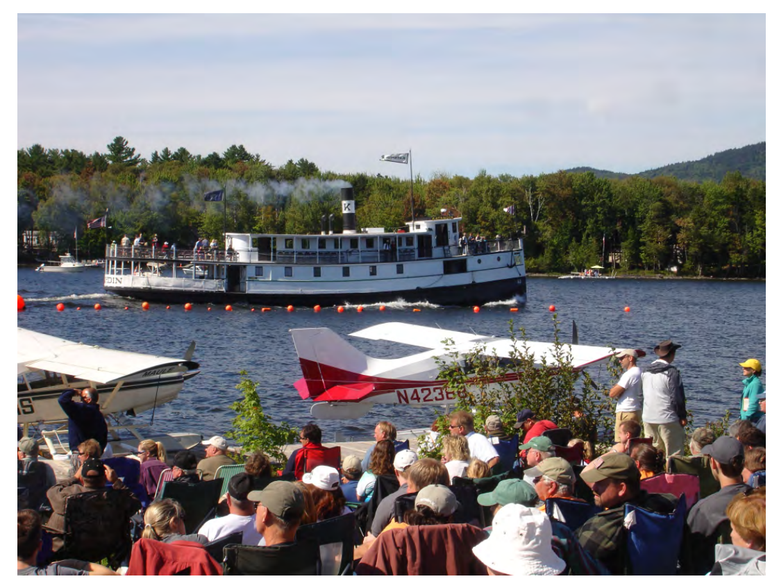
picture of event area, that ship is the Mt. Katahdin heading out for a lake tour.