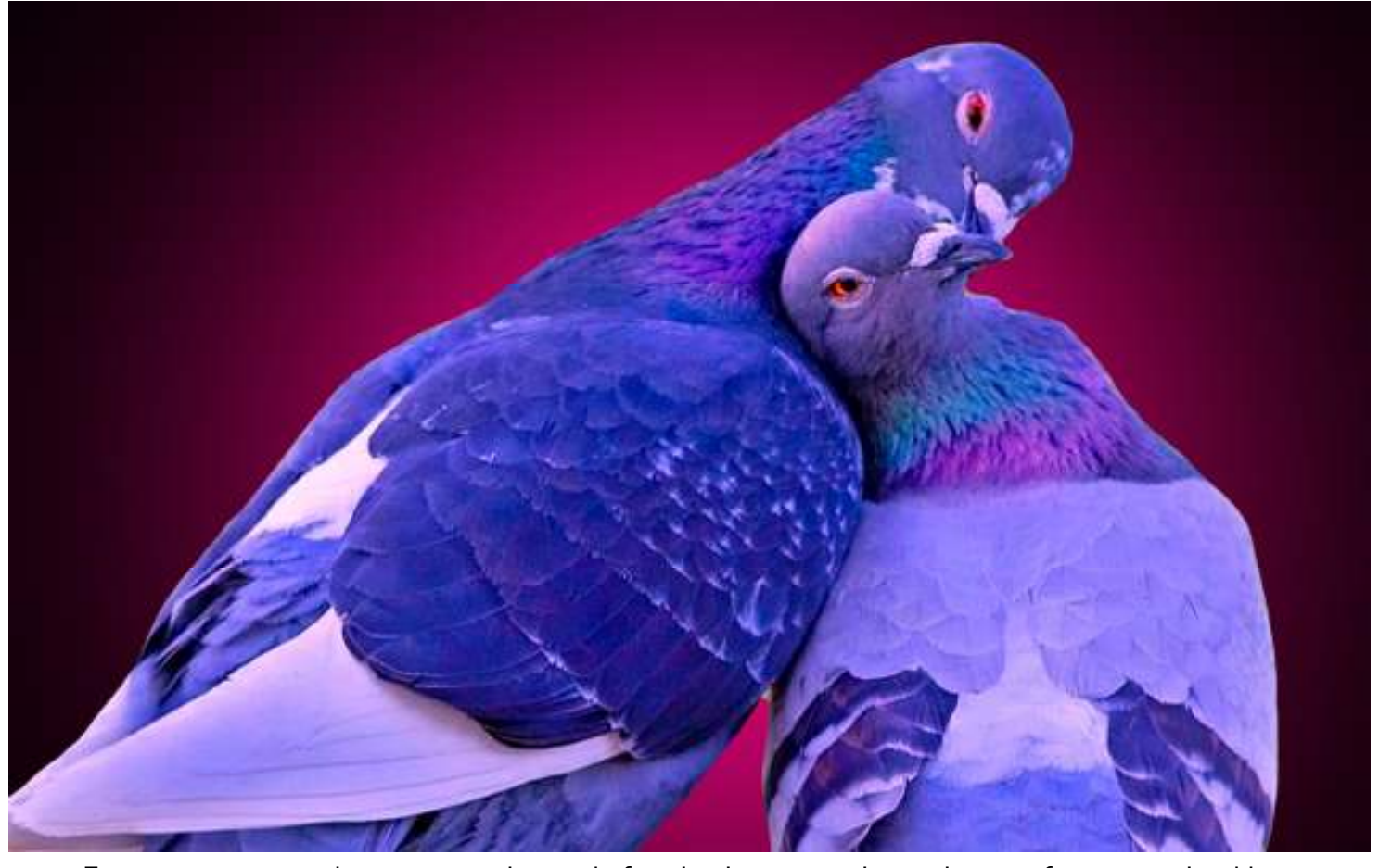
Every moment you show you care instead of saying it, you receive an image of true sustained love. Anonymous