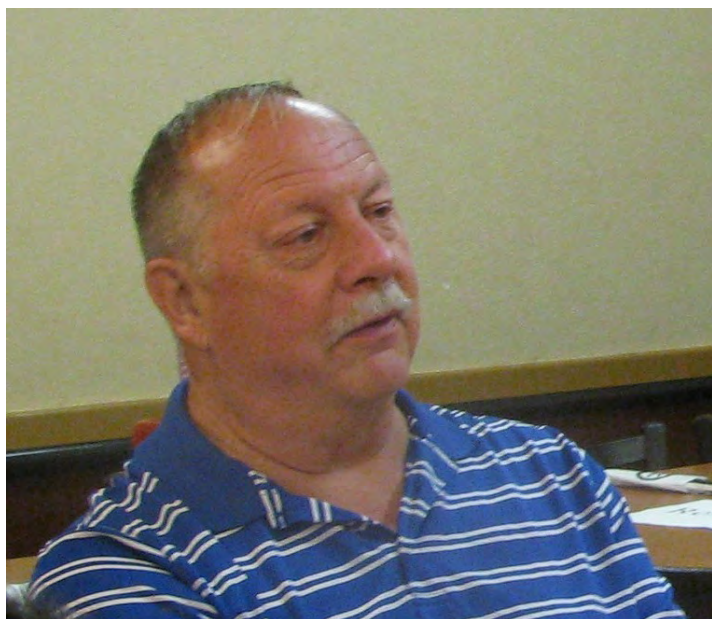
At the eyeball in Delaware

tenna/tower and talking me into taking my extra exam in the near future.