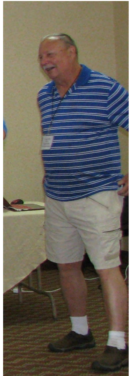
At the eyeball in Delaware