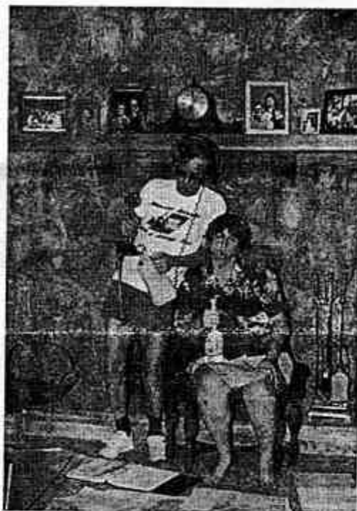
A typical Suck Creek Mountain couple after a night on the Century Club net.