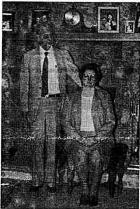
A typical Suck Creek Mountain couple relaxing on the weekend.