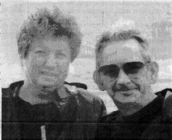
The Group & the actual leader of the group

Even though we tried to fill out QSL cards daily, I am sure that we made mistakes. If you worked us and didn't get a card or got an incorrect card, please let us know. We kept written records of the