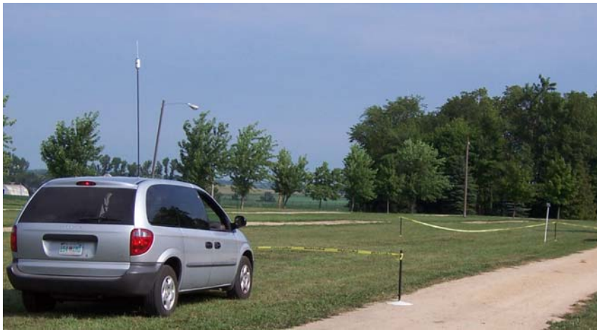
The top-van prepares for the antenna shootout.