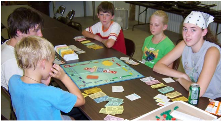
Youth had games to keep them busy.