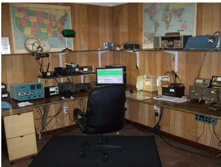
The newly Remodeled Monster Station of N.C.