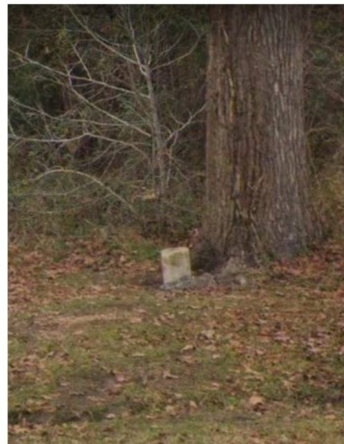
TX-LA-AR Tripoint Marker